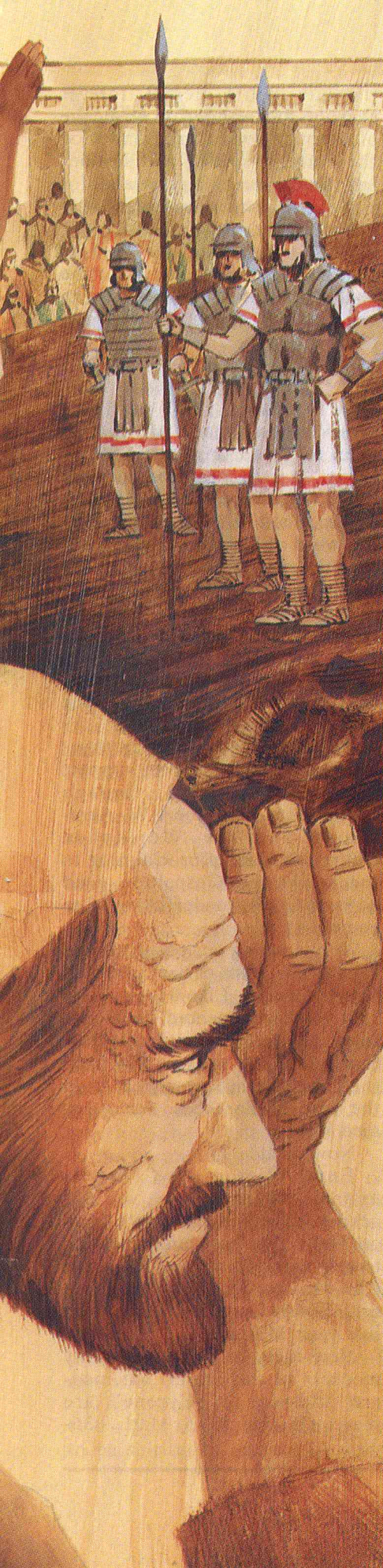
Illustration by Ken Turnell